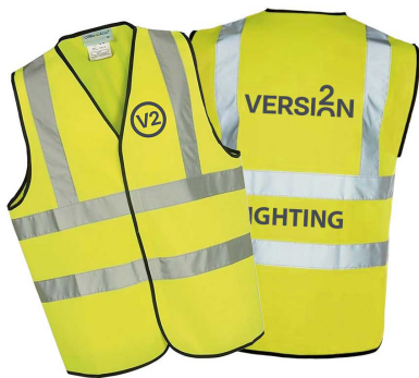
Hi-Visibility apparel, clearly marked as Lighting Crew

The health, safety and well being of all staff, crew and customers is of paramount importance. Version 2 have available a selection of PPE, including COVID-19 relevant items. Please contact Version 2 for details